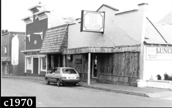
The facade of the McPhillamy House after it was fully converted into the Peg Leg Saloon.